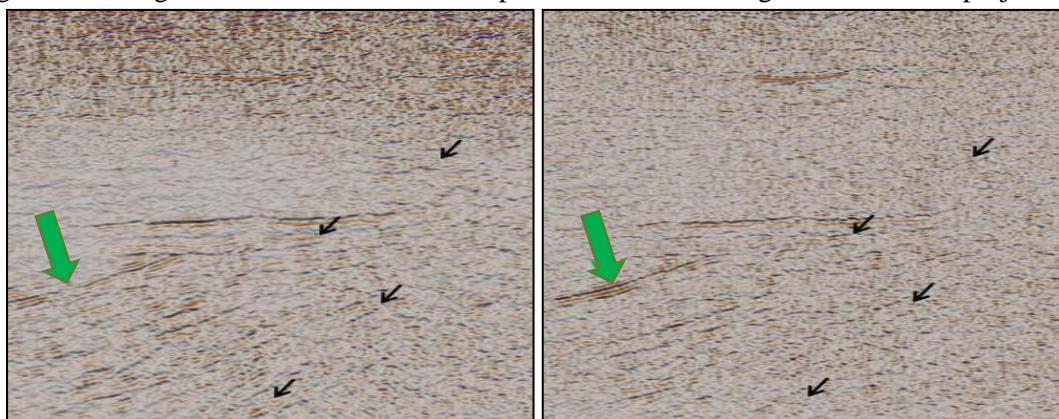
Figure 2 4D difference sections between the 2011 and 2008 vintages showing the reduction in 4D noise for data processed in 2016 (right) compared to 2011 (left).

The Gullfaks seismic monitoring program has made successful use of available acquisition and processing to make improvements to the repeatability and the 4D image. Employing up-to-date acquisition and processing technologies, including broadband solutions, sets a path towards future high resolution 4D projects.